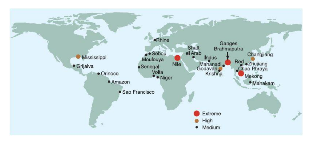
Figure TS.8. Relative vulnerability of coastal deltas as indicated by estimates of the population potentially displaced by current sealevel trends to 2050 (extreme >1 million; high 1 million to 50,000; medium 50,000 to 5,000) [B6.3]. Climate change would exacerbate these impacts.